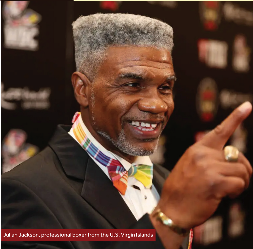
Julian Jackson, professional boxer from the U.S. Virgin Islands